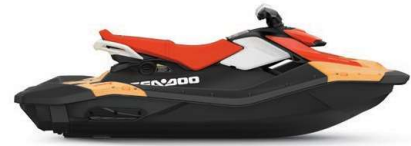
● Sunrise Orange and Dragon Red